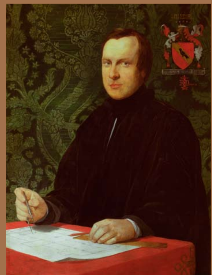
An 1845 portrait of Pugin by John Rogers Herbert RA in its Pugin-designed frame (Palace of Westminster)

why such an ambitious building stands on its dramatic hillside site above the little village of Colebrook. In 1853, when construction of a Catholic church was being considered, the growing settlement, situated on one of two roads linking Hobart and Launceston, seemed destined to become an important centre in southern Tasmania. But that never eventuated.