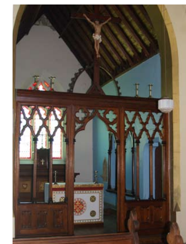
The Colebrook cedar rood screen with its 1847 polychromed figure of Christ carved in White Pine by George Myers' craftsmen in London (Brian Andrews)