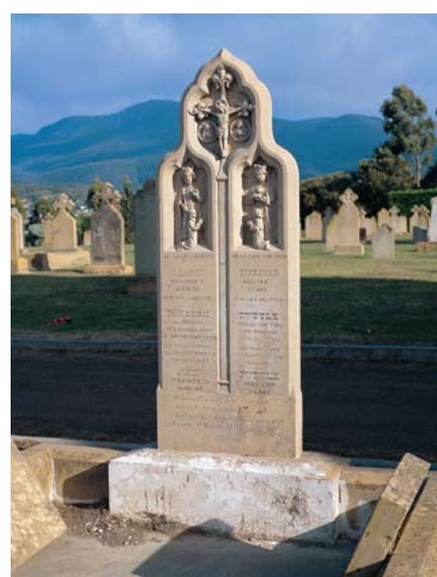
An 1847 headstone brought back to Tasmania