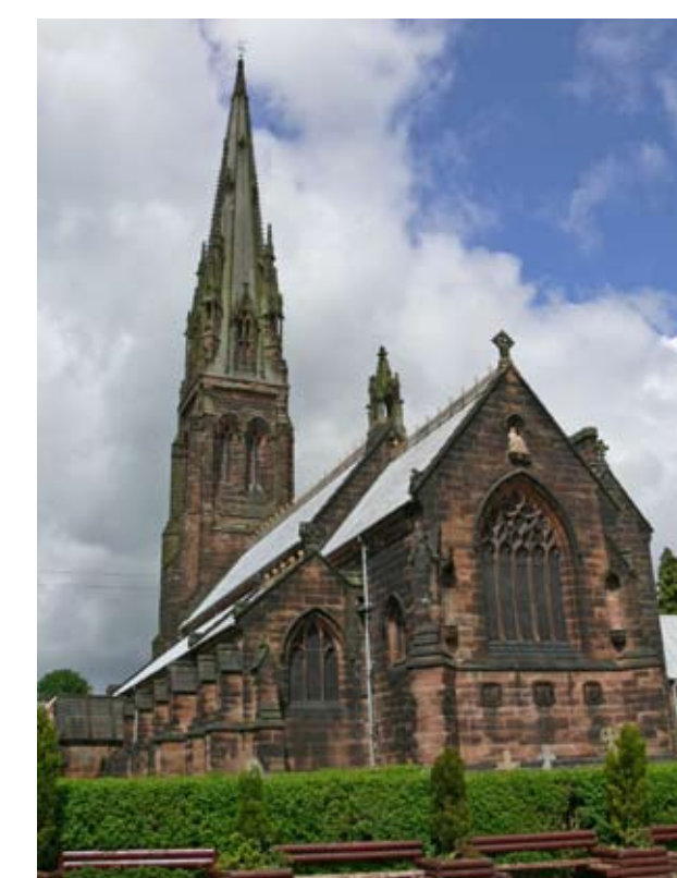
St Giles', Cheadle, Staffordshire

His dream of achieving a better, more just, society may have faltered, but the exquisitely beautiful designs he created have enriched our antipodean culture.